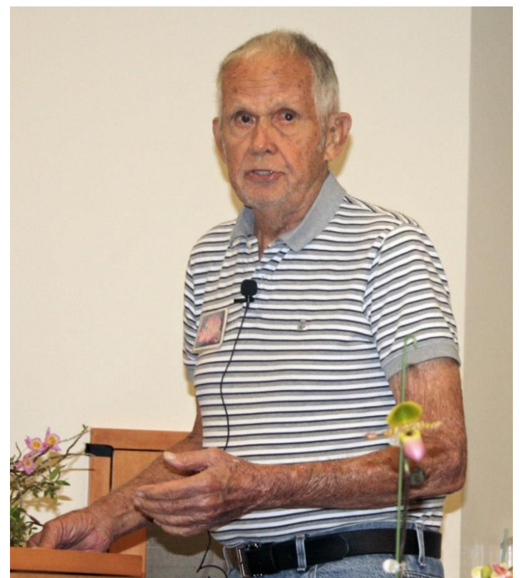
GREAT CLUB BUYS