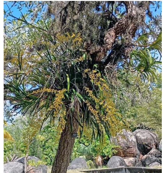
Zoo (Diane Dickhut)