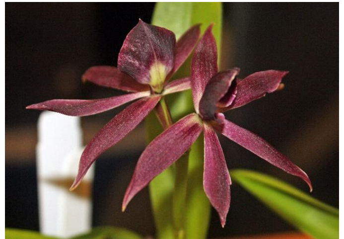
Guarechea [Grc.] Black Comet Unknown