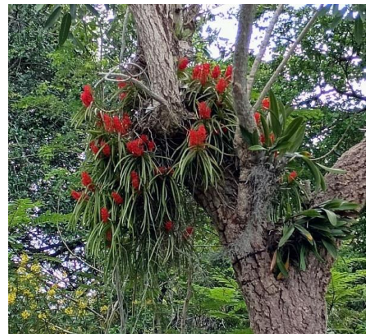
Zoo (Diane Dickhut)