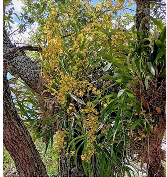
Zoo (Diane Dickhut)