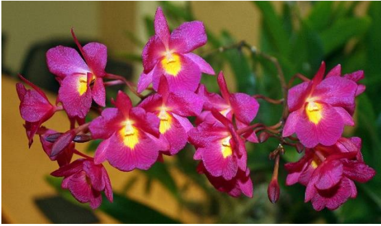
Cattleytonia [Ctna.] Why Not David Foster