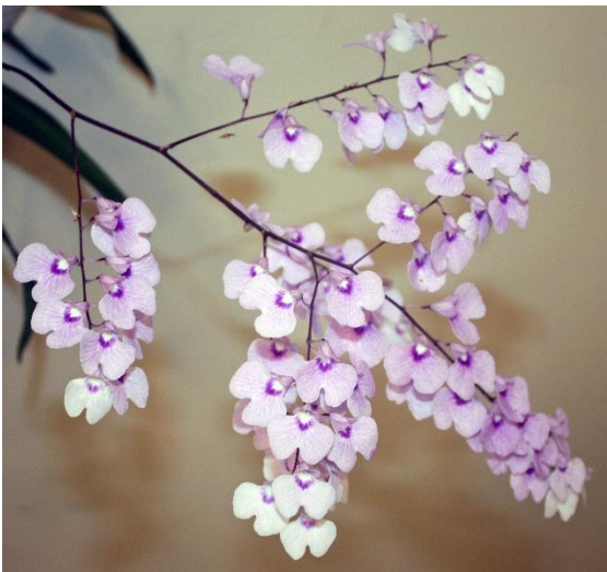
Ionopsis [Inps.] utricularioides Diane Dickhut