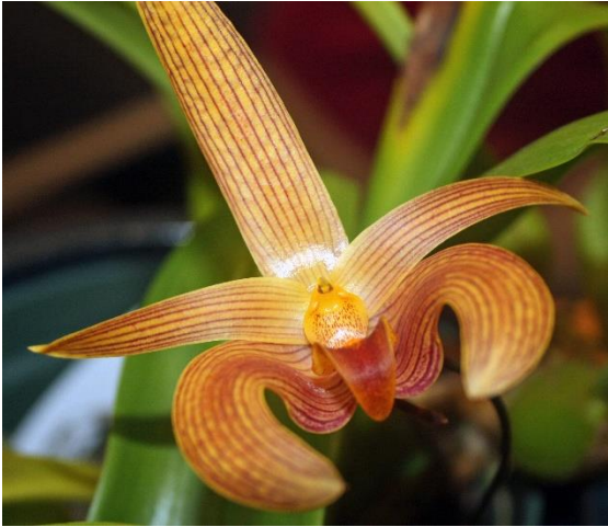
Bulbophyllum [Bulb.] sumatranum x Bulbophyllum [Bulb.] veitchianum Diane Dickhut