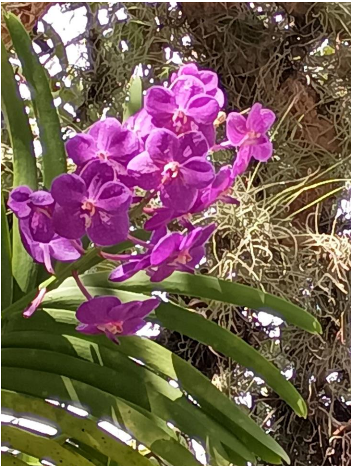
Zoo (Diane Dickhut)