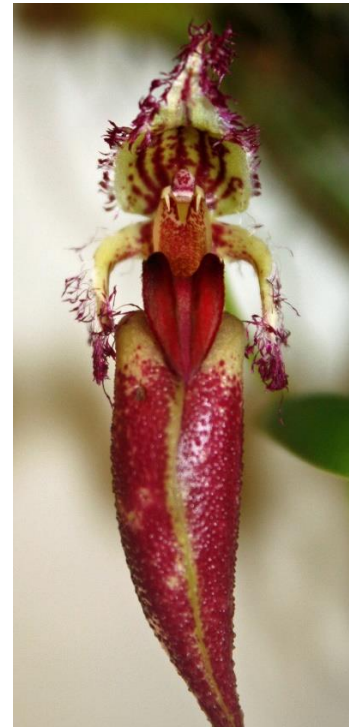
Bulbophyllum [Bulb.] fascinator Diane Dickhut