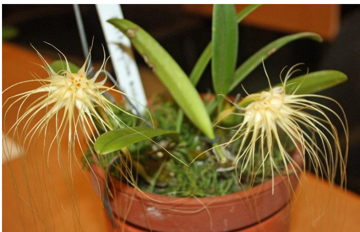
Bulbophyllum [Bulb.] medusae Jorge Li